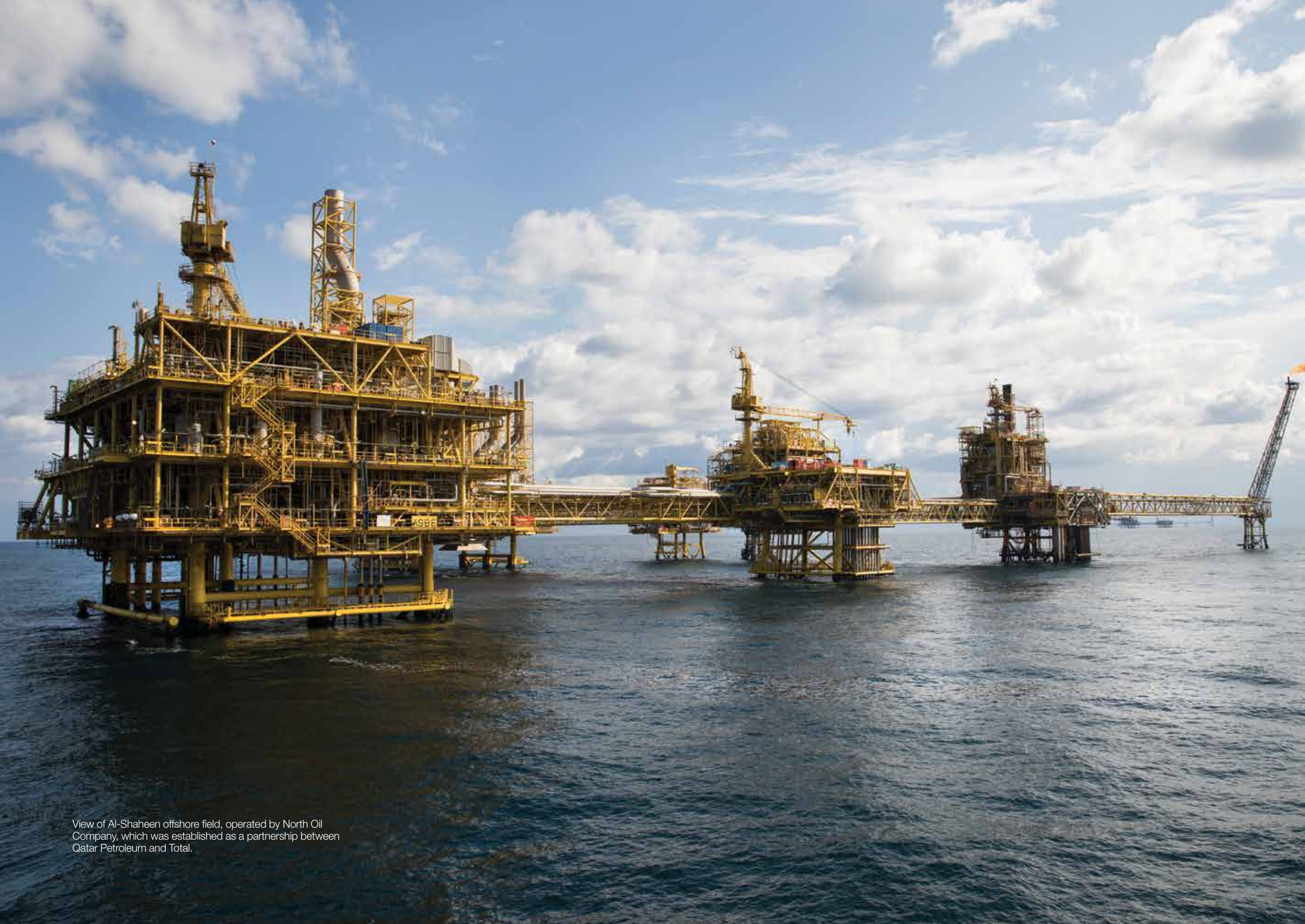
View of Al-Shaheen offshore field, operated by North Oil Company, which was established as a partnership between Qatar Petroleum and Total.